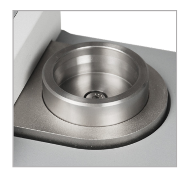
WT3003 Machinable blank terminal fixture For unique sample shapes and sizes.