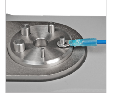
WT3002 Ring terminal fixture Secures ring terminations. Pin diameter sizes from 1/8 to 3/8 in [3.2 to 9.5 mm].