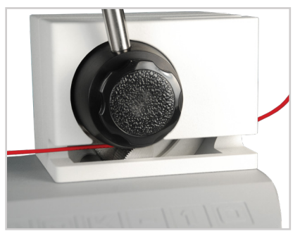
Unique knurled cam design effectively secures and pulls the loose end of the sample.

Mark-10 Corporation www.mark-10.com info@mark-10.com